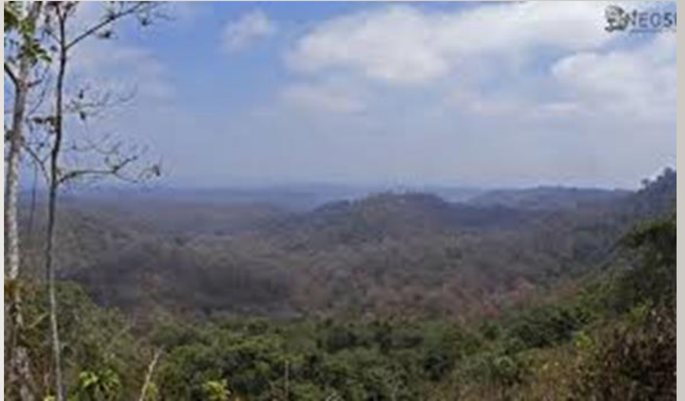
The Dry Forest